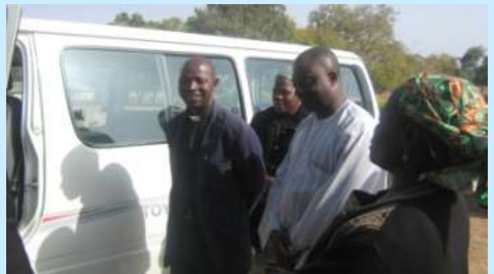
CCDP Board Members Praying on the new bus procured