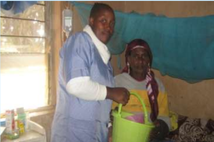
Staff at CCHC Panyam presenting the CCDP Christmas gift to a patient on the ward