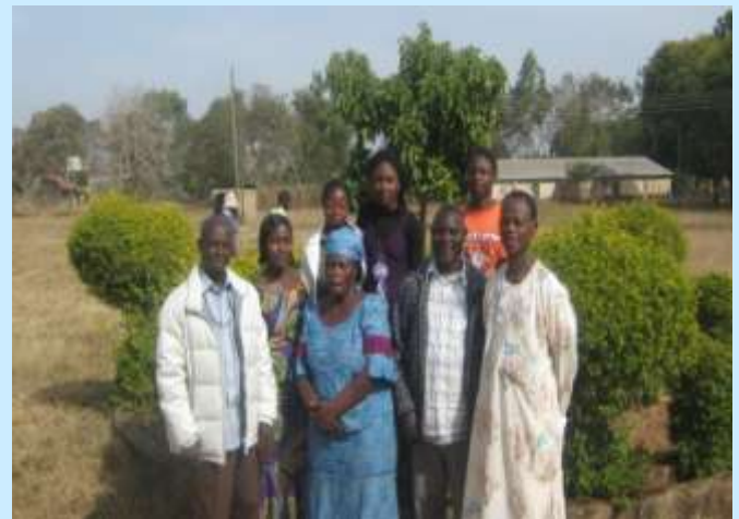
CCDP Management with IT students from Plateau Polytechnic