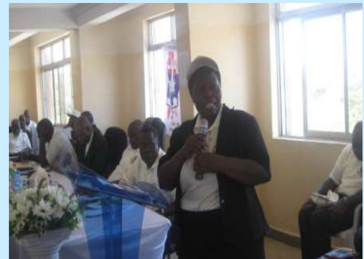
CEO, CCDP at CAACP's 10 years anniversary celebration, COCIN Hqtrs