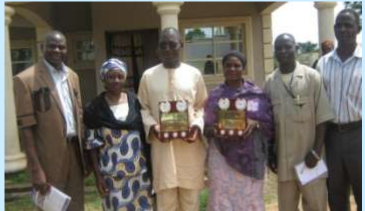
CCDP-OXFAM farmers that won the Food Hero award at Abuja