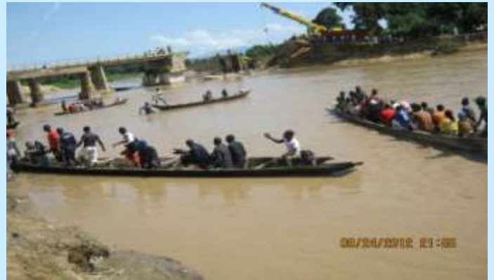
Means of transportation after the collapse of Shendam Bridge