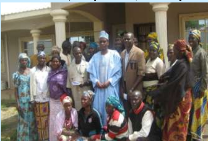
CCDP_OXFAM farmers' visit to TIC Chairman Mangu LGA