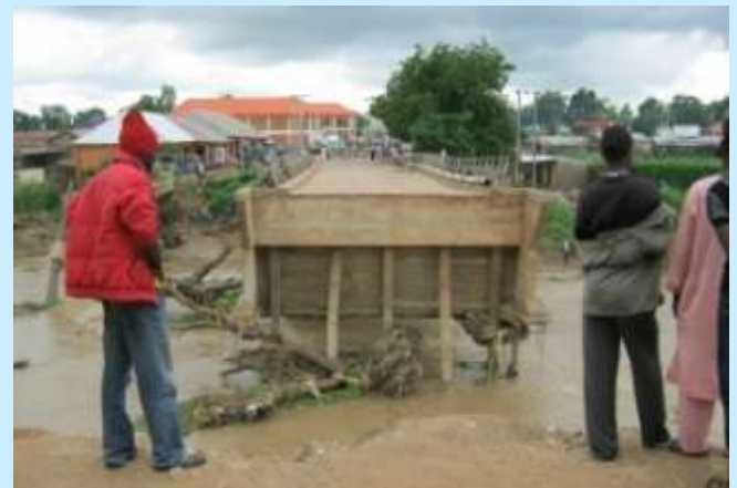
The Collapse bridge inside Shendam town