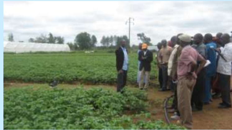
CCDP-OXFAM farmers' visit to ASTC Vom