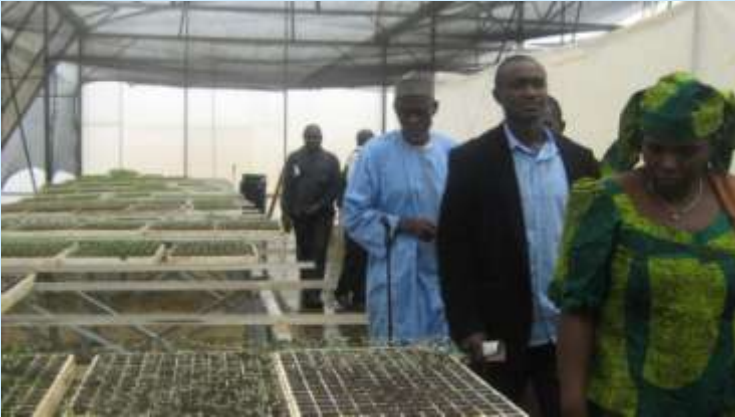
CCDP-OXFAM farmers on tour of facilities at ASTC Vom