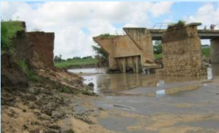
Collapse bridge that links Shendam and Yelwa towns.