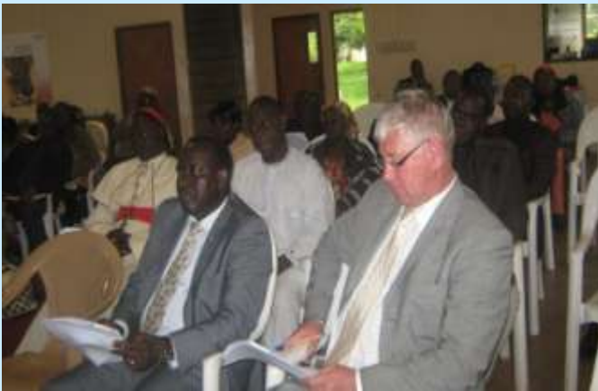
Participants at the fellowship meeting at Miango Rest Home