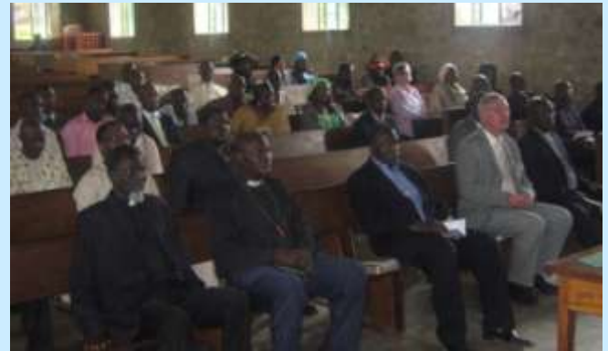
Cross section of participants at the peace fellowship meeting.