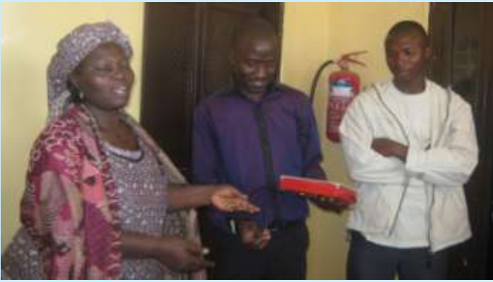
Dedication of a Genotype machine at CCHC Panyam